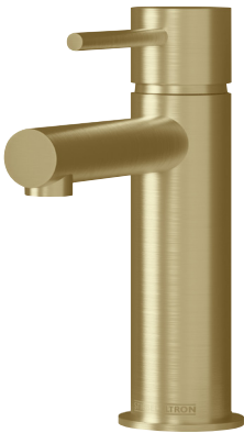
Brushed Gold Article no. 207889