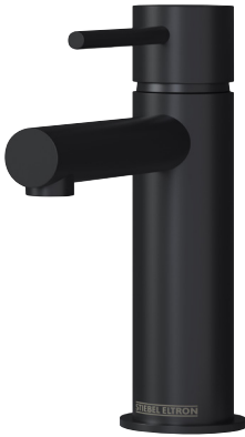
Matte Black Article no. 207888