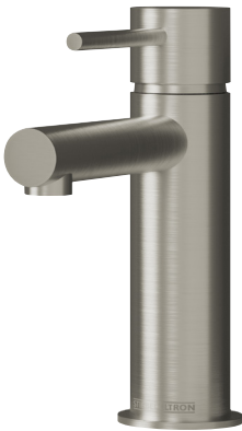
Brushed Nickel Article no. 207890