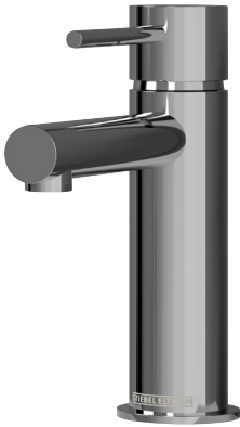
Chrome Article no. 207887

STIEBEL ELTRON is committed to our policy of continual improvement, some features may have subsequently been changed or even removed. Our advisors will be happy to consult with you regarding the currently applicable equipment features. The images used in this data sheet are for reference only.